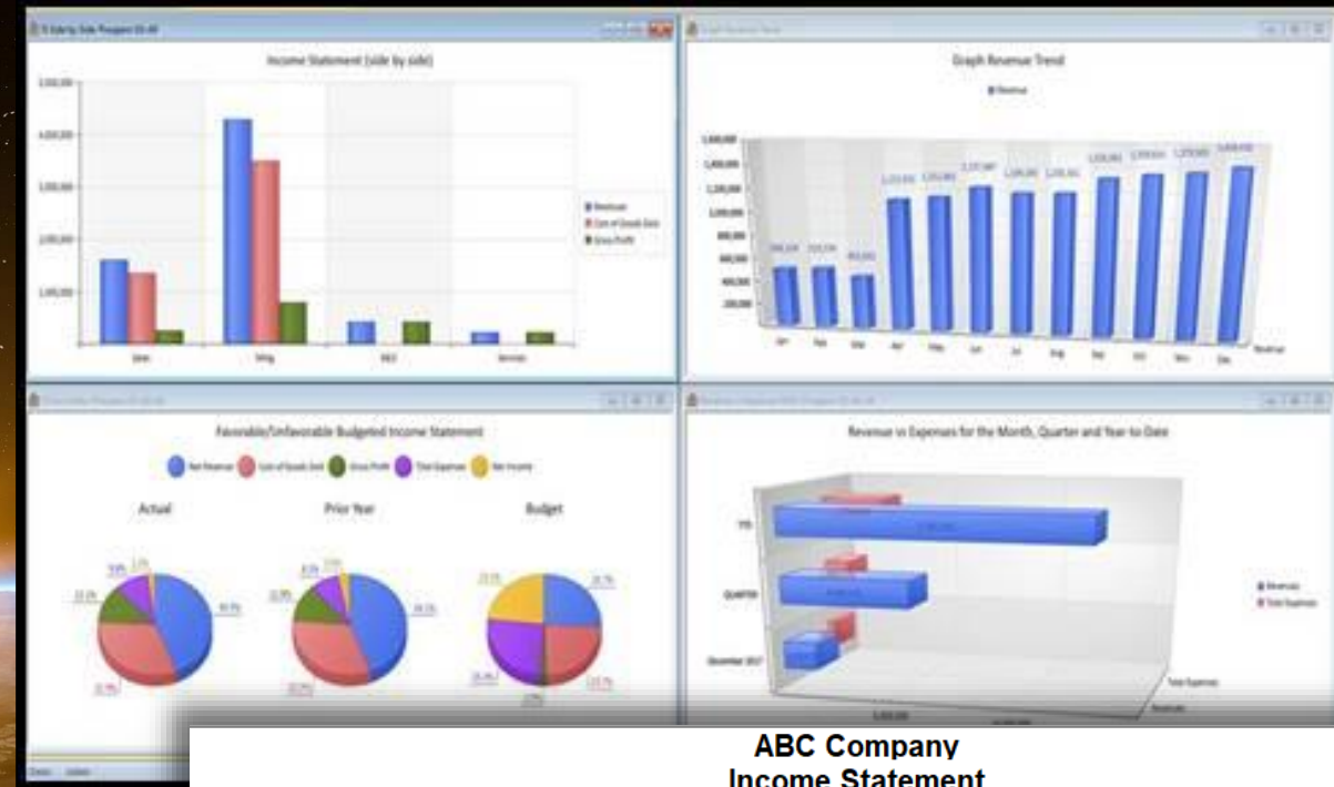
ABC Company Income Statement July 2018