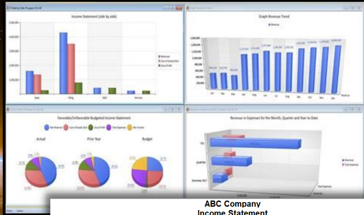
ABC Company Income Statement July 2018