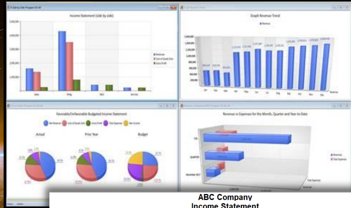
ABC Company Income Statement July 2018